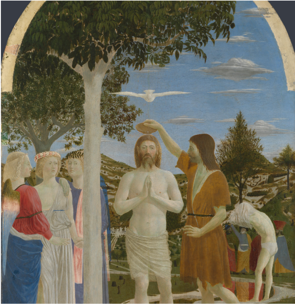
Creator: Piero della Francesca